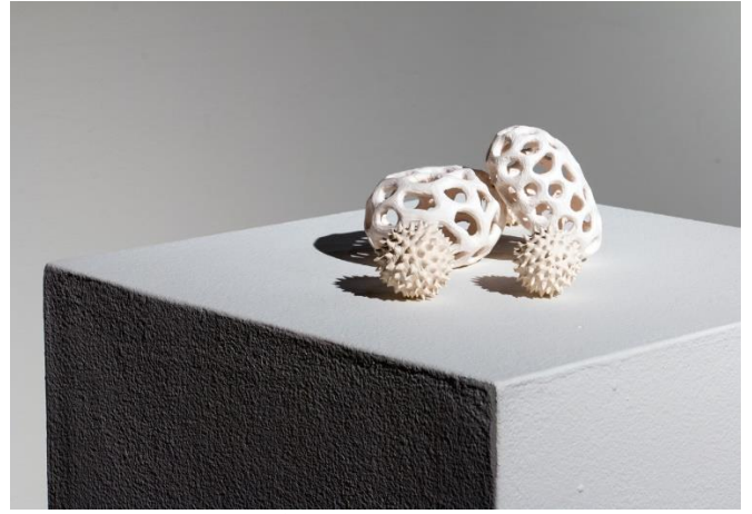
Image from After the Pedestal , 9 th exhibition of small sculpture from the region, 2016.