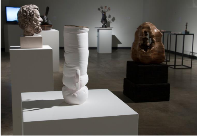
Image from After the Pedestal , 9 th exhibition of small sculpture from the region, 2016.